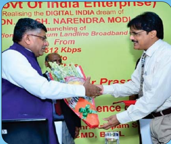
Launch of New Scheme by BSNL