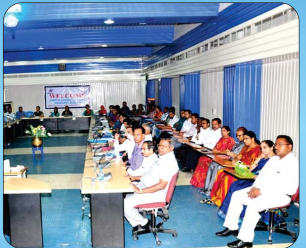
NATFM Conference Hall