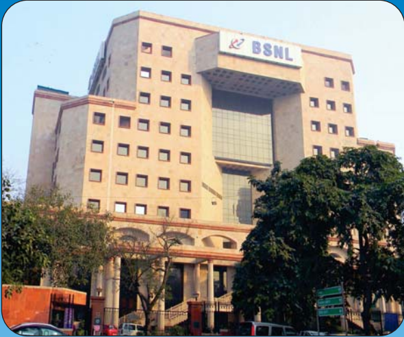
BSNL Corporate Office, New Delhi