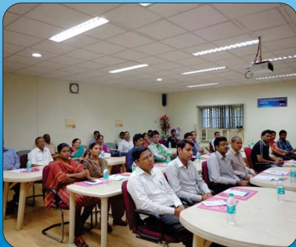
NATFM BSNL Class-room