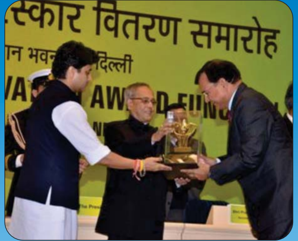
CMD BSNL receiving the "National Level Energy Conservation Award" from Hon'ble President of India