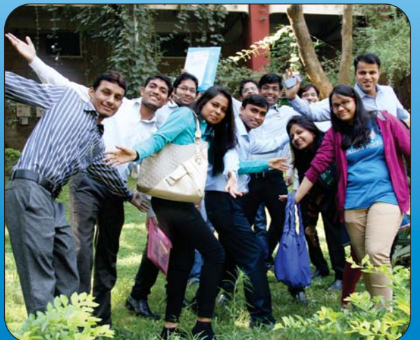
RailTel Executives (Induction Training) at NATFM BSNL